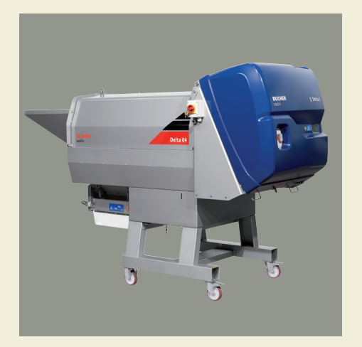
Delta E4 / F4

A worldwide network of distributors authorized by Bucher Vaslin provides a local field service. All products are manufactured by the company. World leader in the pressing equipment, Bucher Vaslin can supply you with spare parts for 20 years. The CE marking certifies that tank presses are in conformity with European Directives. Bucher Vaslin S.A. is an ISO 9001: 2015 and OHSAS 18001: 2007 company registered through Bureau Veritas.