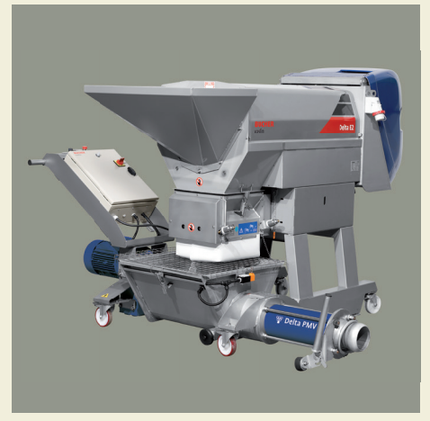
Delta E2 / F2 / PMV2