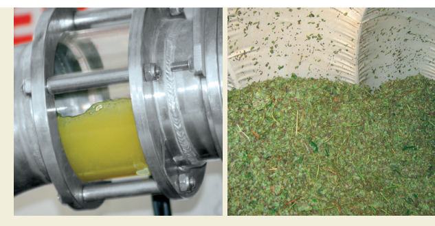
Must derived from Inertys® pressing

With oxygen-free pressing the difference is instantly apparent.